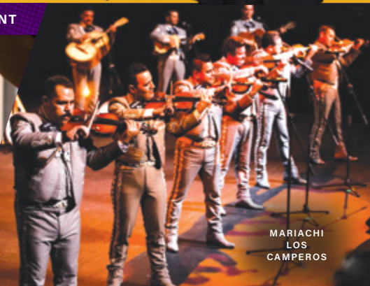
MARIACHI LOS CAMPEROS